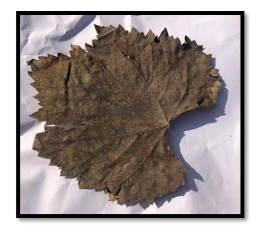
Figure 2. Leave Affected by Powdery Mildew