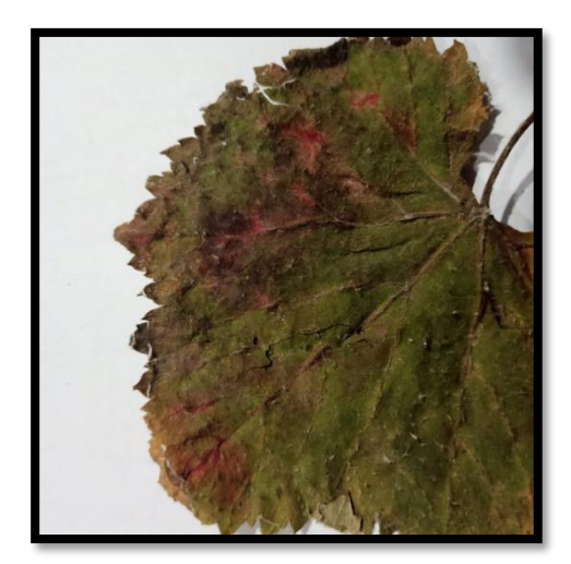
Figure 3. Leave Affected by Red Blotch

Traditional methods of diagnosing diseases in grapevines often rely on expert observation, which can be timeconsuming, subjective, and prone to error [2]. Furthermore, these methods may not be feasible in grapevines large gardens because of the labor-intensive nature of the survey. Consequently, there is a great need for reliable and effective