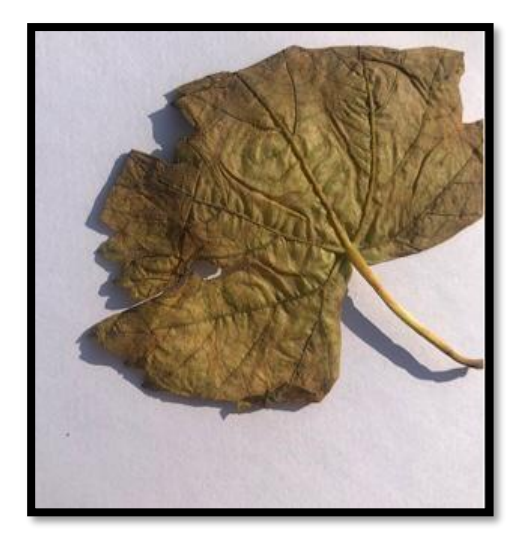
Figure 1. Healthy Grape Leave