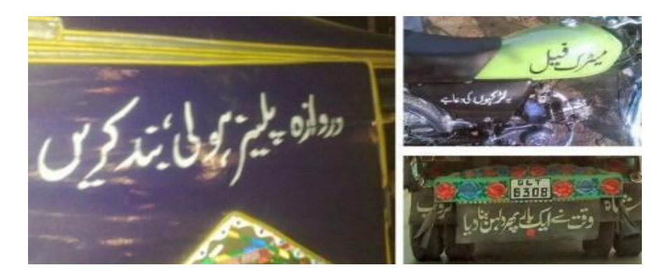
Figure 13 Example of Everyday Life Annoyances on Vehicle 3

English translation of image: (Polite message to close the car's door gently)