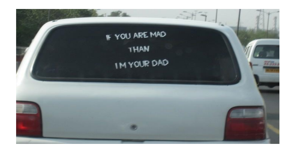
Figure 10 Example of Mind Baffling Messages on Vehicle 4

English translation of image: (Finding the missing one that "I MISS MY MISS")