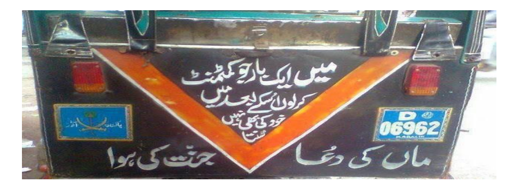
Figure 3 Example of Life's Mission Statements on Vehicle 3

English translation of image: (When I get committed to something then I even do not listen to myself); it is a type of satire about stubborn people living in society. It has another slogan which means "Mother's prayer is the ultimate guarantee of entering into Heaven."