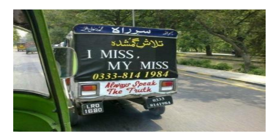
Figure 9 Example of Mind Baffling Messages on Vehicle 3

English translation of image: (Finding the missing one that "I MISS MY MISS")