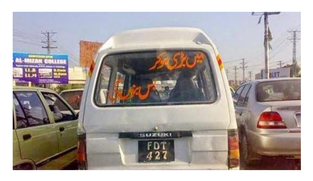
Figure 2 Example of Life's Mission Statements on Vehicle 2

English translation of image: (When I grow old, I will become Bus); again, this type of vehicle is small, and the driver wishes to have a bus.