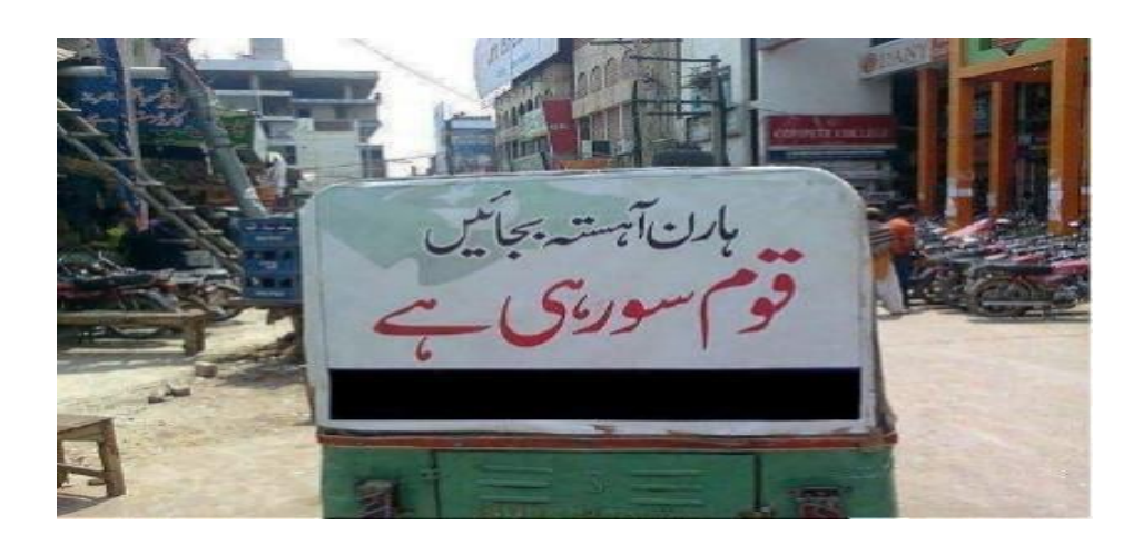
Figure 5 Example of Loud Messages on Vehicle 2

English translation of image: (It is a stair that uses the horn slowly as the Nation is sleeping) which means people are not serious about changing the destiny of their country.