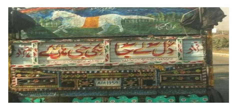
Figure 8 Mind Baffling Messages on Vehicle 2

English translation of image: (Say YES and take away my heart, O my lover)