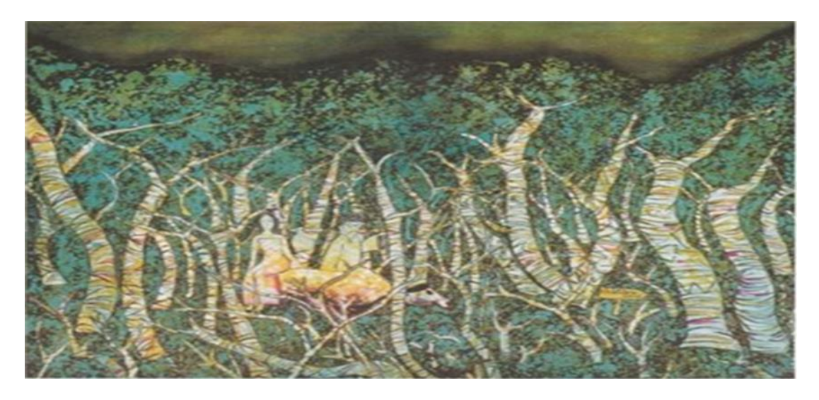
Figure 2 "Ku Bawa Lari Puteri Gunung Ledang" (Eloping with Puteri Gunung Ledang) (2003)