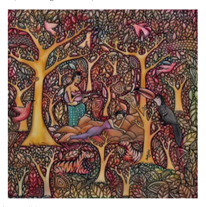
Figure 4 "Menghibur Puteri" (Entertaining the Princess)