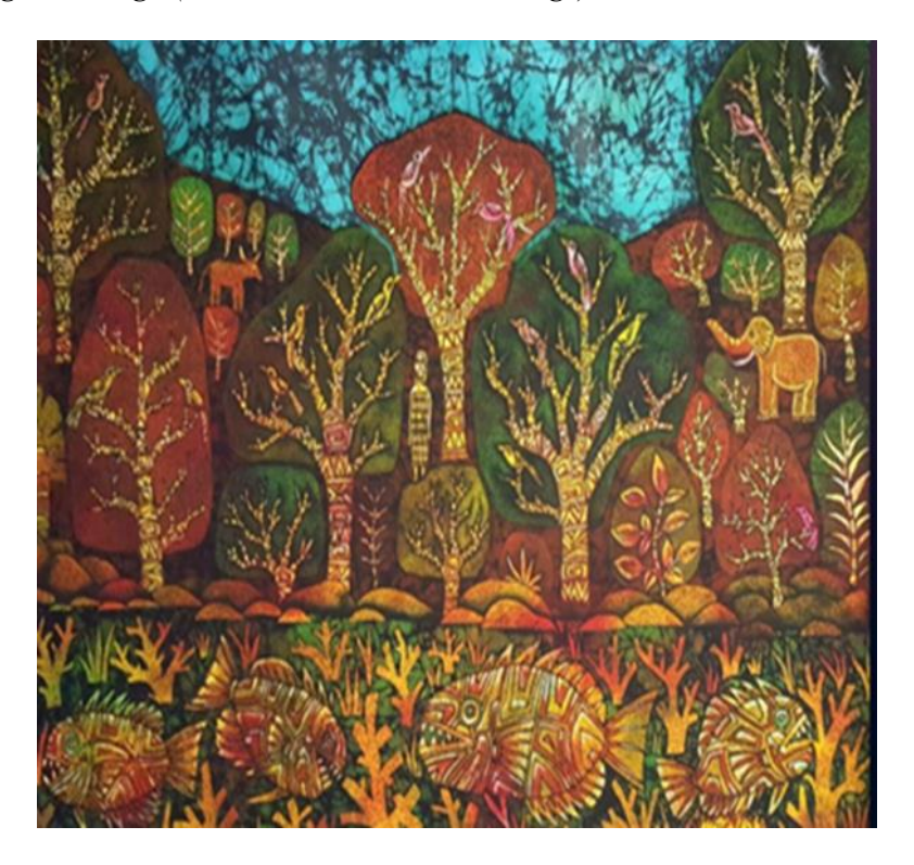
Note. Courtesy of Mat Dollah

"Puteri di Pinggir Gunung" (Princess at the Mountain Edge)