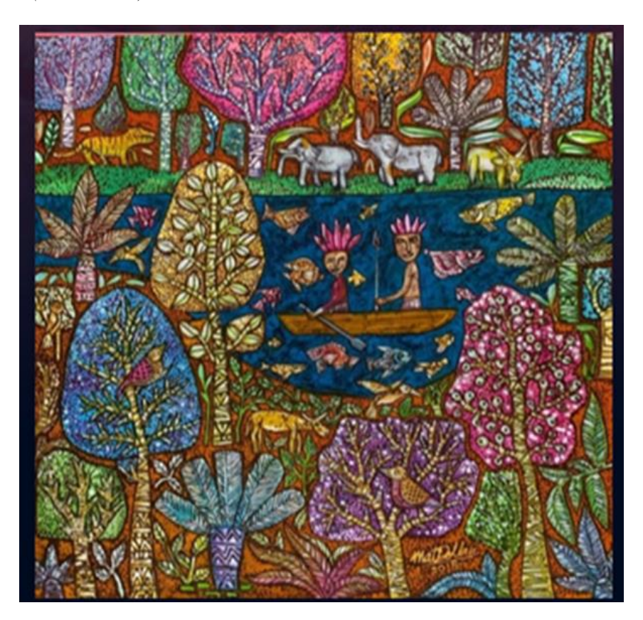
Figure 5 "Aku Dan Dia" (Me and Her)