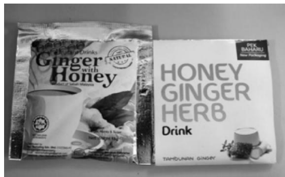
Figure 4: Products from Tambunan Ginger

Among the main issues related to his business was that there were no readily available ginger processing machines to optimize the production line. Thus in 2008, Hendry enrolled in workshops on processing technologies and applied for a loan from Sabah Farmers' Organization Authority (FOA). He was able to commissioned machines that able to increase their efficiency in ginger peeling process. Specifically, his ginger peeler machine is an adaptation of the potato peeler machine from China. With the utilization of these machines, eight kilograms of ginger can be peeled in three minutes instead of five kilograms in a day if by hand. He also invested in product development leading to a range of ginger based products.