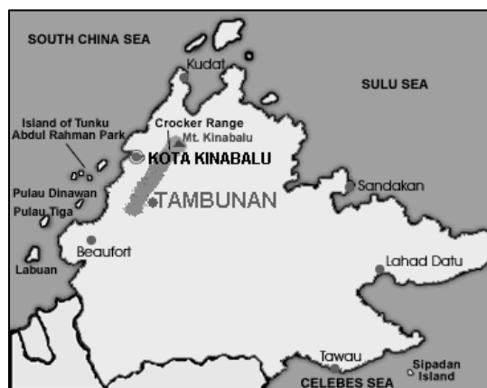
Figure 2: Tambunan, Sabah

Tambunan itself is in the valley of the Crocker Range, benefits from an all year round mild tropical climate. Thus, it is largely an agricultural area and distinctively known for the bamboo forests that resulted from the British colonial era where an edict was passed that required 20 bamboo sprouts had to be planted for every bamboo cut. Against this background and rich ecosystem, a number of enterprising locals capitalised on resources and produced various innovative solutions.