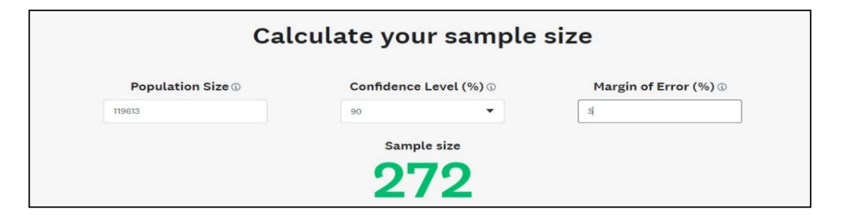
Figure 2: Sample Size Calculation

This study investigates the online shopping preferences of residents in Nilai, Negeri Sembilan, Malaysia, where the digital infrastructure supports a vibrant e-commerce environment. With 84.2% mobile phone penetration and 27.4 million active internet users, Malaysia offers a fertile ground for digital consumer behavior research. Nilai, in particular, has emerged as a key retail hub with facilities such as Nilai Square, AEON Mall, and MesaMall. The town's total population stands at 119,613, making it a significant sample locale for studying consumer trends. To accurately capture the online shopping behaviors in Nilai, a calculated sample size of 272 was determined using Survey Monkey's sample size calculator. This number was based on a 90% confidence interval and a 5% margin of error, ensuring that the findings are both reliable and representative of the broader population. This structured approach addresses the various challenges in e-commerce, from cybersecurity risks to the adaptation of new digital marketing tools. Figure 2 shows the number of sample sizes generated using the sample size calculator.