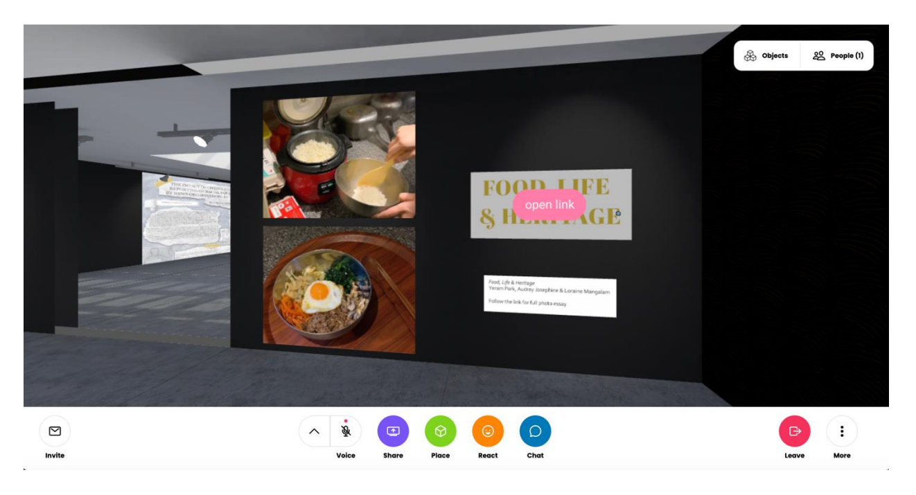
Figure 2 Images from a Photo Essay on the Gallery Wall. The Link Takes Visitors to the Students' Own Website with the Full Project (2022)

Visitors to the Gallery – included those who have produced its artefacts – are provoked to discover without a hierarchy of work or a clear path. Many works are short excerpts or snapshots, with links to other sites; navigating the space requires a process of curation from the visitor. The space therefore asks students to consider the quality of the work in the context of the Internet at large, and acts as a node around which students develop an interactive mode of engagement, with active exchange taking the place of passive consumptions (Chi and Wylie 2014). This affordance is further exploited with the use of social media to promote and link to the Gallery.