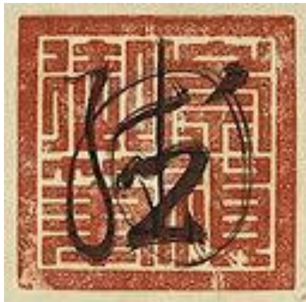
Figure 3. Chongzhen Emperor’s Signature and Seal. Source: [5]

I played around with several layouts and ideas, thinking if I should build the words through imagery, through the use of negative space, or clipping masks. In the end I decided to overlay the text on the lichen image using a simple layout where the words can be read from left to right and up to down and laid the Chinese characters out in a square format reminiscent of traditional Chinese seals (see Figure 3). I also used blending modes to visually combine and “connect” the text with the image. Figure 4 shows the process in which I experimented with the initial 4-character layout and even tried to rotate each of the characters.