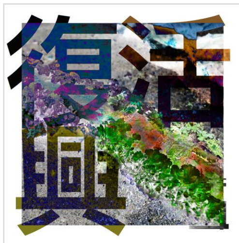
Figure 5. "Tapestry of Co-Creation"

Eventually, I felt that the text had now become the domineering feature of the artwork and the lichen imagery had become lost in the background. In the spirit of wanting more of a balanced coexistence between text and image, I removed the 4th character from the text layout to allow the lichen imagery to come to the foreground and fill up the space. I also played around with the layer positions of both text and image to illustrate the idea of interconnectedness. The final outcome is a multilayered digital artwork reflecting the ideas of finding ecological balance while embracing technological advancement, and redefining personal identity anchored in cultural heritage and roots (see Figure 5.).