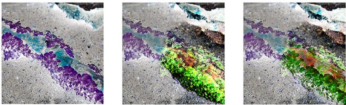
Figure 2. Process of Editing and Manipulating the Lichen Photo in Procreate

I explored this concept through the use of the lichen photograph I had captured, which I then digitally manipulated in Procreate to distort the colours as an expression of its function as nature’s bioindicator. I then decided to make it look only partially distorted and added a cropped overlay of the same image only this time using blending modes to make it look vividly green as if vibrant with life. The manipulation was done through the use of duplicate layers and experimenting with different blending modes to get the visual effect I wanted. The distortion symbolises a marker of potential destruction and loss if we do not find that sustainable balance. The vibrant green of the lichen represents the bold resilience of nature and transformative power of sustainable efforts. Then through the use of the glitch filter, I layered it with glitches that hint at the entanglement of technological advancements such as artificial intelligence (AI) which is now very much a part of the creative process of various domains [4]. I then sought to find a balance in which one effect does not overpower the other. Figure 2. shows the aforementioned creative process.