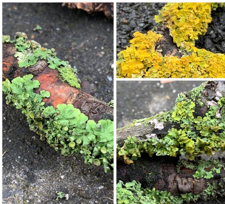
Figure 1. Sample Photos of Lichen Captured by the Artist