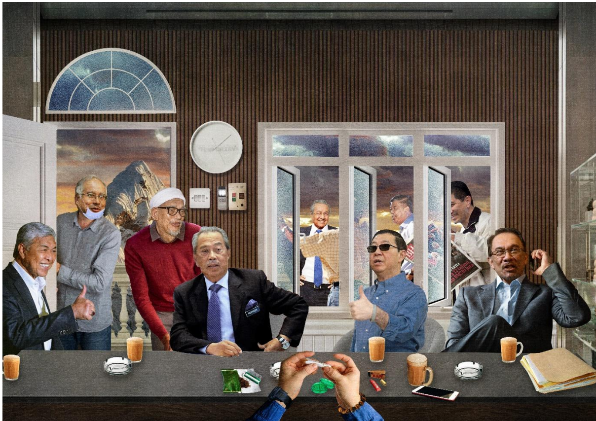
Figure 1. Yang Last Sapa? (Who's the Last?) , Digital Photo Collage, 2020

The collage was developed using digital photo manipulation techniques. Archival images of political figures were carefully selected and rearranged within a single visual frame. Spatial composition and facial expressions were analysed to reflect each character's public role and legacy. The collage employs publicly circulated photographic images as satirical quotation for the purpose of political commentary.