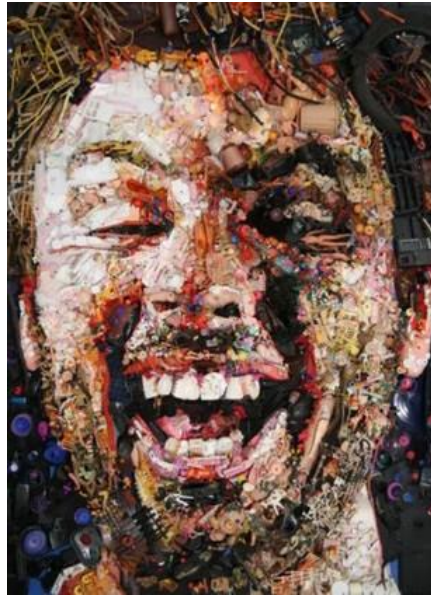
Figure 2. One of Tom Deininger's Artwork