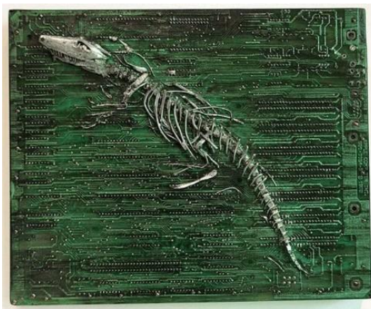
Figure 3. One of Peter McFarlane's Artworks