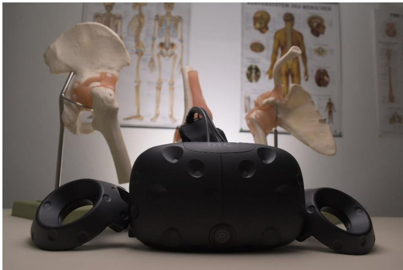
Figure 1 Virtual Reality Technology is used to Study Human Anatomy.